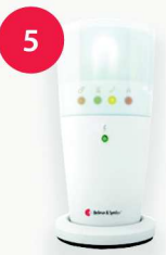
5 Flash receiver Alerts with bright lights