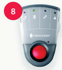
8 Pager receiver Alerts with vibrations