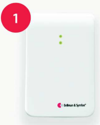
1 Door transmitter Monitors the doorbell

The Visit system helps people with hearing loss to notice signals in their home, like for instance the doorbell, telephone or smoke alarm. Always knowing when something happens provides peace of mind and an increased sense of security. Here you can learn more about how the various Visit transmitters and receivers work in a typical home.