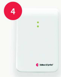
4 Telephone transmitter Monitors phones & tablets