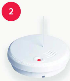
2 Smoke alarm Detects smoke and fire