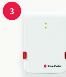
3 Baby monitor Monitors your little one