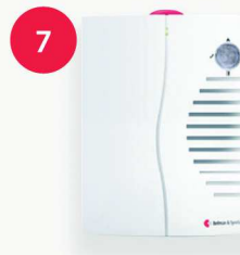
7 Portable receiver Alerts with sound and light