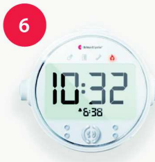
6 Alarm clock Uses sound, light & vibrations